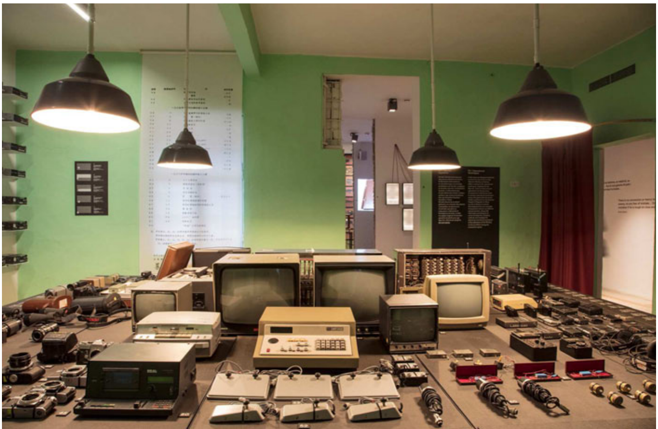
Surveillance equipment inside "House of Leaves"

The newly minted museum serves to commemorate the "physical violence and total control of citizens ( http://www.assembly.coe.int/nw/xml/News/News-View-EN.asp?newsid=7721&lang=2&cat=21 )" in communist Albania. Communist dictator Enver Hoxha ruled Albania beginning in the 1940s, disposing of his rivals and throwing thousands who opposed him into prison, according to The Associated Press ( https://ap-news.com/38aa27b4e98471696bdf9e72a8e71bef ).